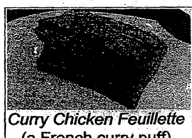
(a French curry puff)

The curry puff is a small pie with a curried potato filling. It is sold at food centres, snack kiosks in shopping centres, bus interchanges and even cafes. It's available almost everywhere in Singapore!